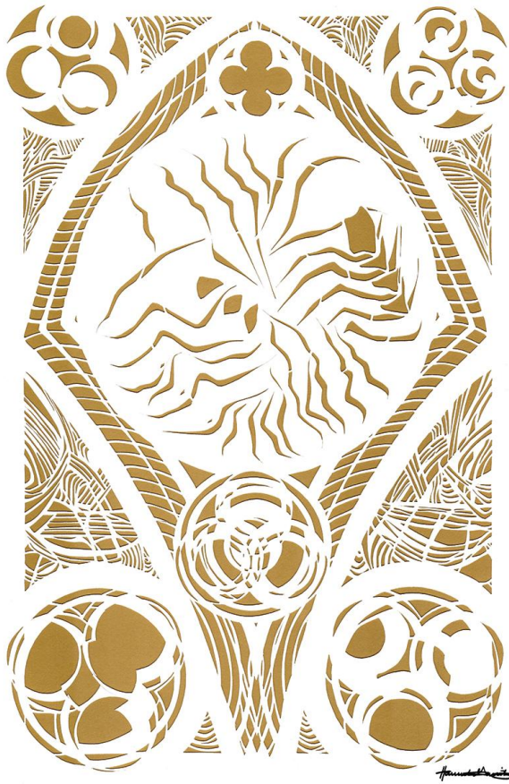
Image: Enough by Hannah Garrity | A Sanctified Art LLC | sanctifiedart.org

Artist Statement: This image depicts the joyful motion of a party, the lights in particular. The lines in this stained glass window design are inspired by photographs of light glowing and moving, dancing in the night. In the center circle, the shadow of a dancing silhouette repeats, echoing the way that we see figures move in two dimensions in the light of the night. In the corners of the window frame, architectural motifs that historically represent the Holy Trinity reflect the light as though shining themselves.